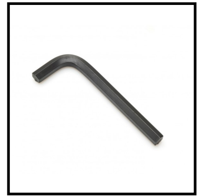
5/16" Allen Wrench