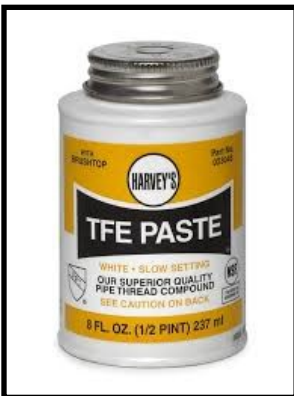
TFE Paste or Teflon Tape