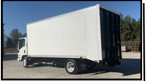
2019 Isuzu NPR-HD Single Cab Starting at $788.12/Month