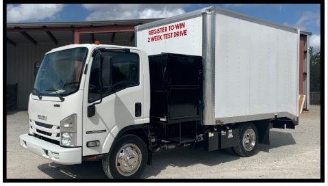
2019 Isuzu NPR-HD with 2.5 Debris Dumper Starting at $1,023.16/Month