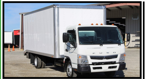
2019 FUSO 160/FEC7TS Gas Starting at $1,043.49/Month