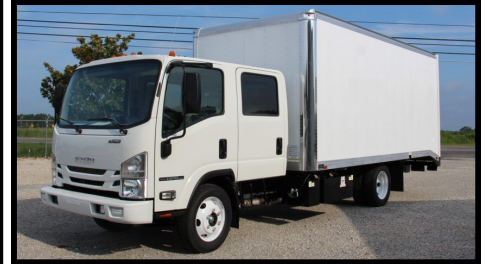
2019 Isuzu NPR-HD Crew Cab Starting at $880.76/Month

-NEW 2019 Isuzu, HE404 Gas, Crew Cab, 176" WB, 14500 lb. GVW, Automatic, A/C, PW/PDL, AM/FM/CD, Fire Ext., Triangle Kit, Bluetooth Radio