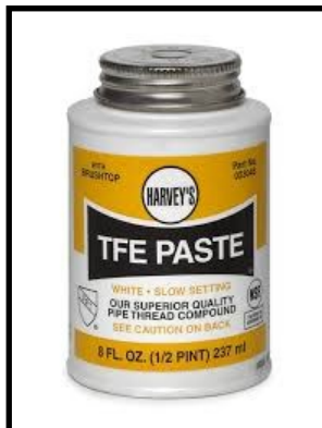
TFE Paste or sealer