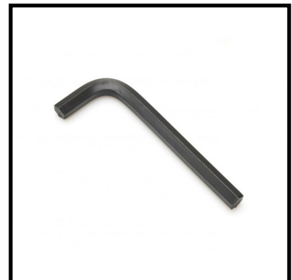
5/16" Allen Wrench